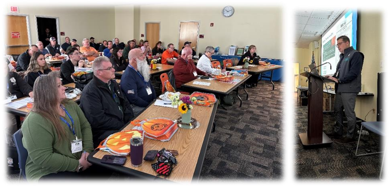
Pictured above are the photos from the October 2023 MRC meeting.

featuring the Clean Communities program reporting best practices from the NJ Clean Communities Council, updates on the Single-Use Plastics Law and how education and inspections are performed at the County level for municipal replication with educational resources by the Morris County Division of Public Health, available grant funding opportunities available by the Lake Hopatcong Foundation, and Morris County Clean Communities programmatic updates for the 2024 calendar year. The Kahoot! game was utilized at both meetings with great success amongst the coordinators.